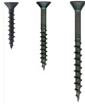
Wood Screws (1 1/4", 2", 3")