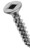
Sharpie (1/2" & 3/4")